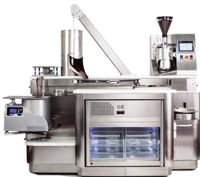
Figure 1 – Multiprocess C full optional

Continuous production systems for chocolate, compounds and creams