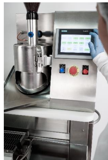
Figure 4 - Control panel

The 5 kg model can include several options according to requests: a tempering machine, a vibrating surface to help the air bubbles out of the shaped chocolate and a refrigeration unit to harden the chocolate to create the finished product. In a full-optional Multiprocess C5 conched chocolate falls through the vibrating sieve directly into the tempering machine's tank, installed where the collection container would be located. The cooling cell is inserted in the lower part of the structure without causing any increase of the overall dimensions of the machine compared to the standard line.