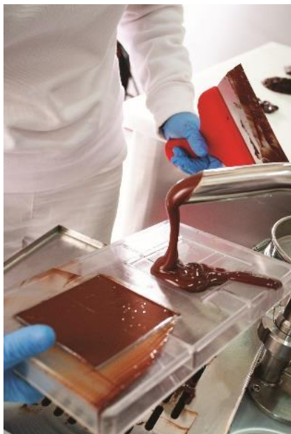
Figure 3 – Shaping of finished chocolate

The cylinder is heated to the desired conching temperature, which is transmitted to the product by contact. An upward flow of air promotes the evaporation of excess water and any unwanted aromatic substances. At the base of the cylinder the chocolate is conveyed either in the initial mixer from where the product starts re-circling or to the vibrating sieve to be tempered and put in shape.