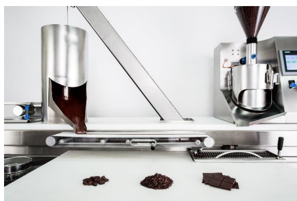
Figure 2 – Ascendent belt, conching tower and re-cycling belt

The process starts with the introduction of the dosed amount of cocoa nibs in the grinding unit to form the paste. The thick cocoa mass created passes through the horizontal mixer, where the other ingredients of the recipe are added, like cocoa butter, sugar, milk, etc. after being weighed to recipe. The maximum capacity of the mixer can vary depending on the Mutiprocess C model and can work 5, 25 or 50 kg.